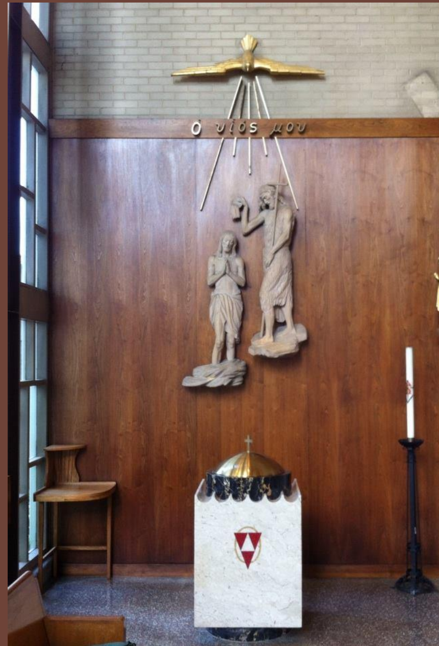
St. Paul Lutheran Church, Melrose Park, Illinois

“Like a sculptor who molds a mass into its desired shape, the Spirit’s sanctifying work lies in shaping Christ’s image in persons. A theology of the Spirit strives at fostering the sanctified life in others by making them participants by grace in the Spirit’s manifold ways of forming persons after the ‘image’ or ‘likeness’ of Christ (Rom 8:29; 2 Cor 3:18)” (Sculptor Spirit, xv-xvi)